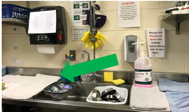
Note: Left side is dirty, right side is clean