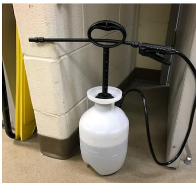
Used to spray/clean cat furniture